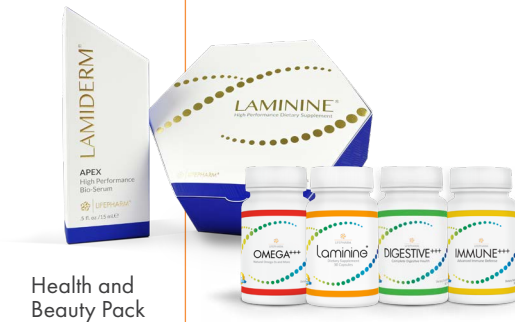
Health and Beauty Pack

5 IBO enrollments × 200 points = 1,000 points